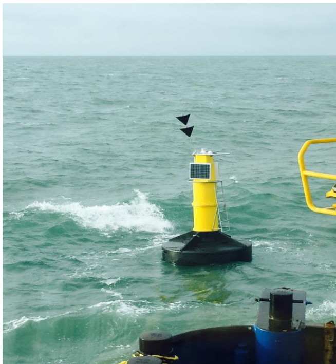
Sealite Atlantic 2600 Type 2 Cardinal Mark

AIS not yet activated as the project is waiting for the OFFCOM licenses to be issued.