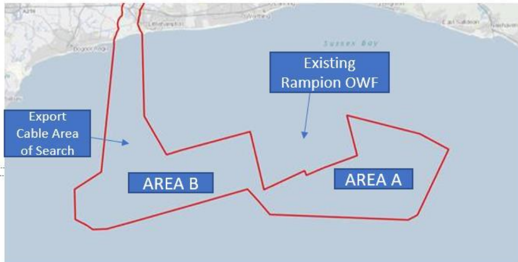
Figure 1 Overview of Survey Area

Rampion 2 OWF Development is being explored within an area of search adjacent to the existing Rampion Offshore Wind Farm, divided for the operations into three areas.